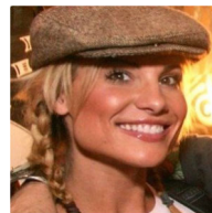
Celebs Who Died Tragically in 2018

So you think you have the flu? Here's what you should do