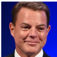
Shep Smith's First Public Remarks Since Leaving Fox News