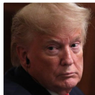
This May Have Been Trump's Biggest Flaw