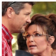
The Main Reason Behind Sarah Palin's Divorce is Pretty Clear Now