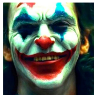
Controversial Movies That Were Box Office Hits