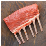
No Wonder Aldi's Meat Is So Cheap